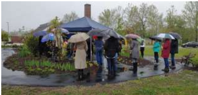
Guided tour docent speaks with DWCNV members Turning Point Suffragist Memorial

For more information about our organization and activities, see our web site at http://www.democraticwomenofclifton.org/ and our Facebook page at http://www.facebook.com/DWCNV . Also feel free to email any questions to cliftonwomen-dems@aol.com . We hope to hear from you.