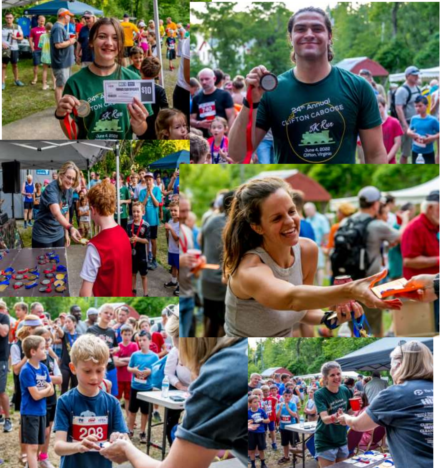
24th Annual Clifton Caboose!